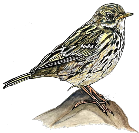
The Meadow Pipit, Riabhóg Mhóna

Habitat: Grass lands, rough pastures, bogs & uplands Diet: Craneflies, mayflies spiders and seeds. Status: An Irish native common bird, Red-listed.