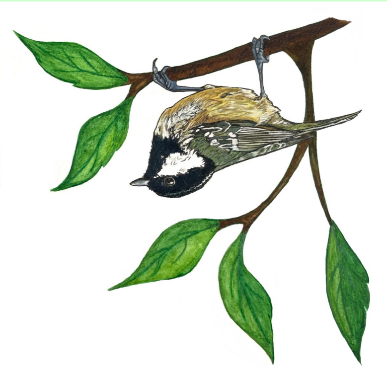
The Linnet, Gleoiseach