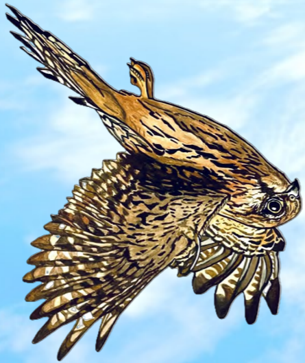
The Kestrel, Pocaire Gaoithe